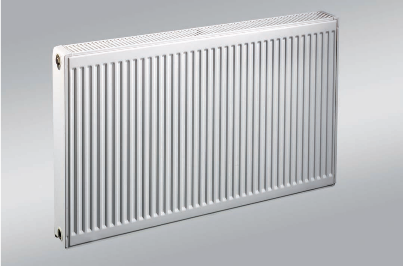
Model shown Strebel SD610H Panel / Double in RAL 9010

These highly efficient panel style radiators are a simple option when selecting a heat output source for any home.