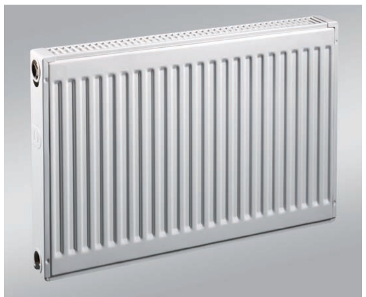
Model shown SP406H Panel – Single with fins in RAL 9010

Additional heights and lengths are available upon request.